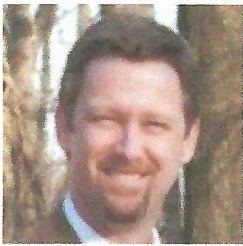
02 Feb 2016 11:00 - 12:15 Verdalla